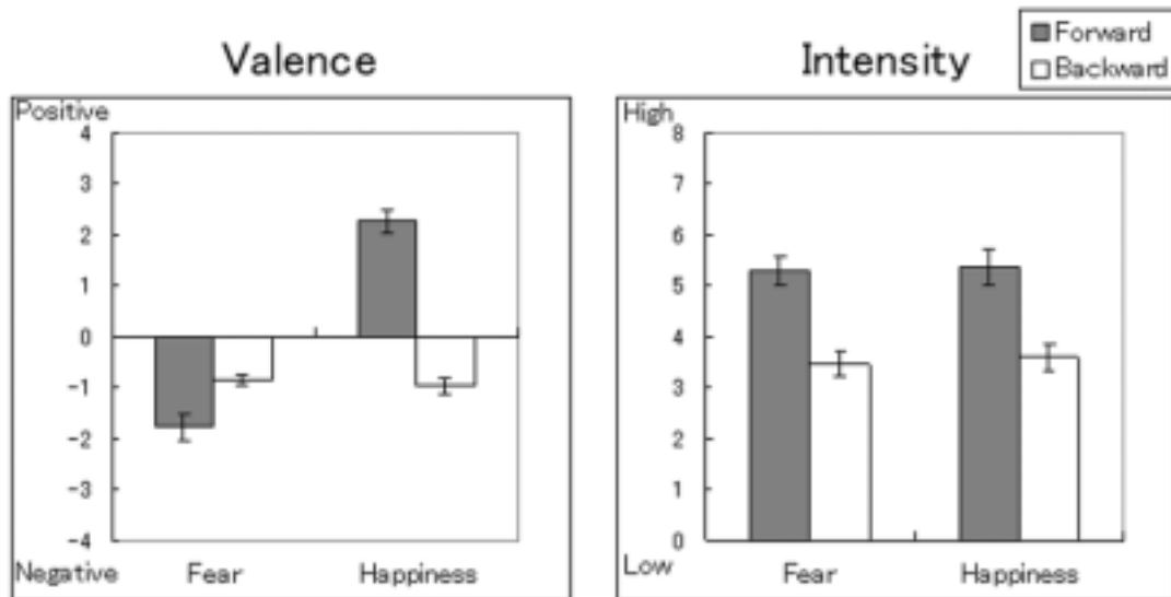
Supplementary Figure 1. Mean ratings (with standard error) for experienced valence (left) and intensity (right).